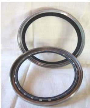
Custom Metal-Cased Seals